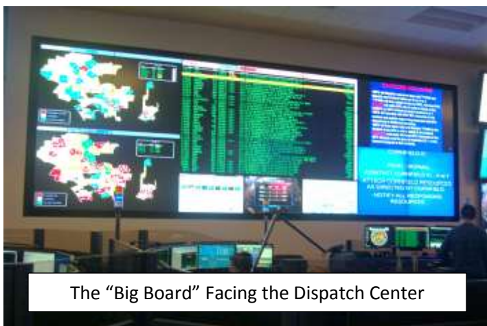
The "Big Board" Facing the Dispatch Center