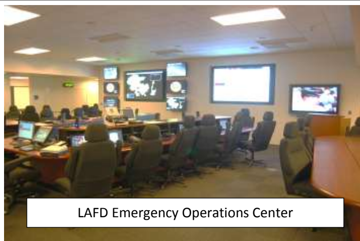
LAFF Emergency Operations Center