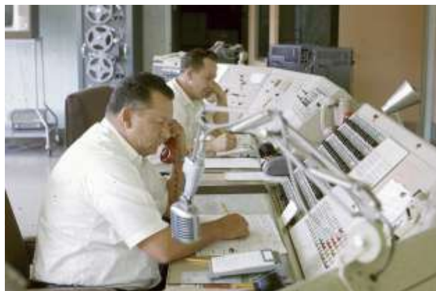
LAFD Coldwater Dispatch Center

It wasn't until 1946 that LAFD engines and trucks became equipped with two-way radios. Configured in the 33-MHz band, the frequencies from this original allocation were used into the late 1980's.