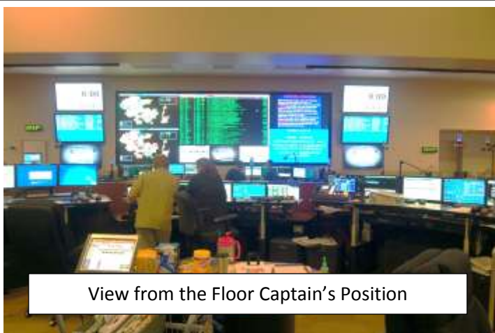
View from the Floor Captain's Position

The Newsletter of the Southern California Monitoring Association