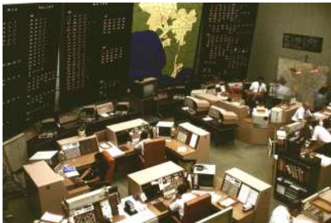
LAFD's Old OCD Dispatch October, 1987

There are 75 Firefighter III/Dispatchers, 9 Captains, and 3 Battalion Chiefs assigned on platoon duty at Metro Fire Dispatch. These personnel are equally divided into three platoons working the same 24-hour shifts as Neighborhood Firefighters. While on duty, the 25 Dispatchers and 3 Captains, all of whom have field experience and are certified as Emergency Medical Dispatchers, are scheduled to work on the "floor" by alternating watches at various times during their 24-hour tour of duty.