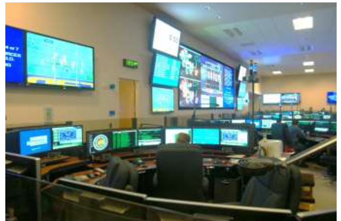
LAFD's New MFC Dispatch November, 2012

The Los Angeles Fire Department is the only major metropolitan fire department in the United States that provides its citizenry with the benefit of highly trained dispatch personnel with years of field fire and EMS experience.